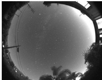
Image earlier in Night with First Quarter Moon in Field

One of the challenges of an All Sky camera is that the moon is in the field of view literally half of the time, averaged over a month. The reflections from within the dome and lens can interfere with detection of stars. Figure Two is an image taken earlier in the night, with the dome in place, that has been DDP scaled to show the stars and the sky close to the moon. Some ghost reflections are visible, but the image quality is excellent.